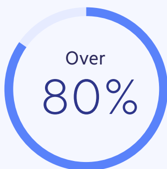
of Physera patients finish their treatment

Over 80% of Physera users finish their treatment (compared to 33% in traditional physical therapy clinics) and 98% show improvement in their area of concern. 2 Any pain reduction reported by our competitors comes at a 3 month mark; Physera patients see these improvements in 6 weeks or less. Employers benefit from a reduction in lost work days and absenteeism and improved employee productivity.