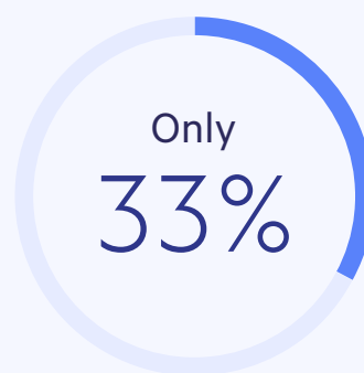
of patients finish treatment in traditional physical therapy clinics

98% of Physera patients show improvement in their area of concern